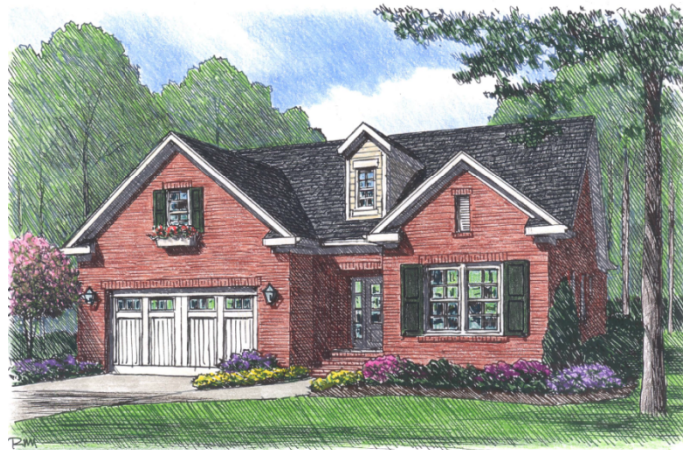
Dickerson Plan Lot 1 Ballentrae 3 Bedroom Ranch 1948 Heated Square Feet